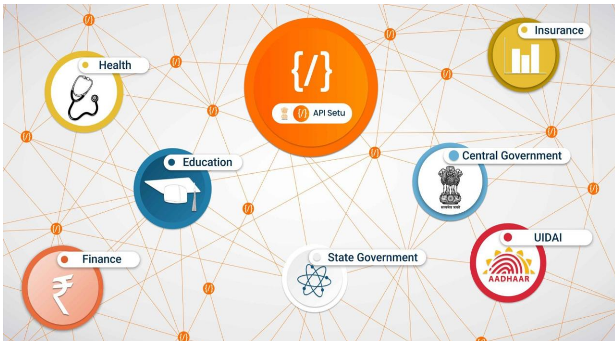
API Setu APIs are interconnected

It hosts a vast number of APIs that are published and consumed by various Government and private entities, who in turn can develop user-centric innovative products for various sectors such as health, education, business etc.